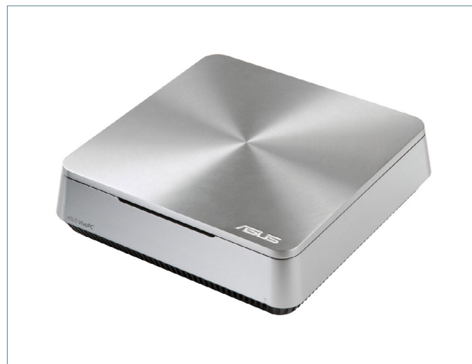
ASUS VivoPC VM40B (OPTIONAL)